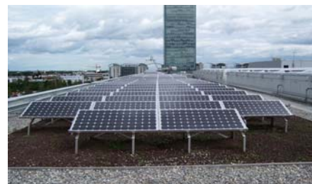
The solar panels were mounted almost to the roof edge in order to maximise the available roof area.