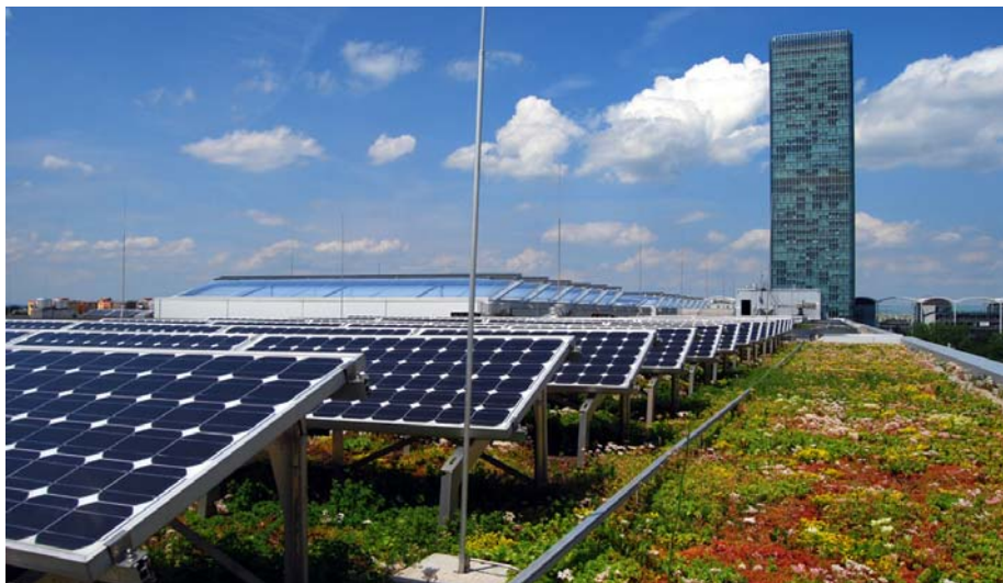
Solar system combined with the fall protection system Fallnet® Rail.