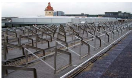
Each Solar Base Frame has been mounted on a 2 m 2 Solar Base Plate SB 200.