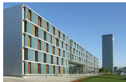
External view of the Munich Technology Centre (MTZ).

Because the solar panels were set up almost to the edge of the roof the additional fixing device Fallnet® SB 200 Rail was installed which allows for safe working in the perimeter areas.