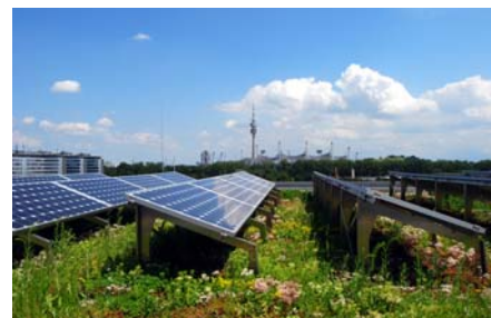
Because a green roof has a significantly lower surface temperature than a blank or graveled roof, the photovoltaic module remains cooler over a green roof and thus a high power outcome is maintained.