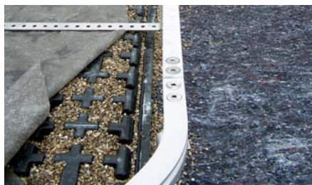
In addition, a rail system was attached to the SB 200 boards to protect against falls.